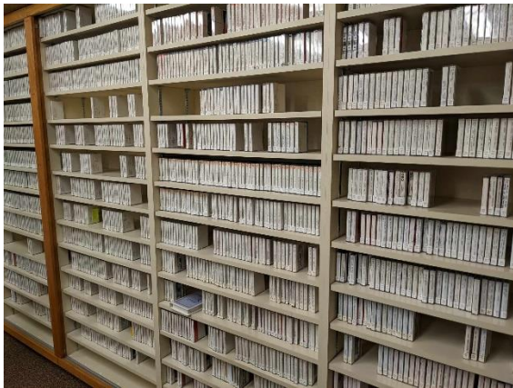
YNLC Archives room housing textual and audio language content.