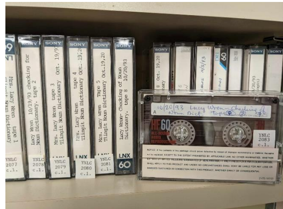
YNLC Archives Lucy Wren cassette tape.

Interested in accessing language archival recordings, texts, photos and more? Archival request forms can be found here: https://ynlc.ca/translations/#ynlc-archives-request-form