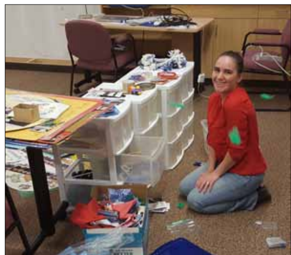
Reorganising at YNLC

Yukon Native Language Centre Yukon College Box 2799 Whitehorse, Yukon, Y1A 5K4 Canada