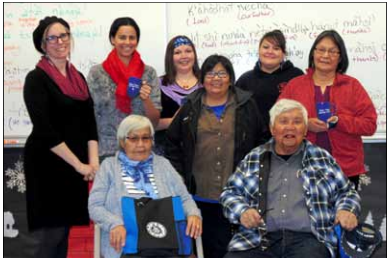
Participants at the 2016 Hän Literacy Session