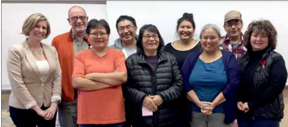
Participants at the Upper Tanana Literacy Session