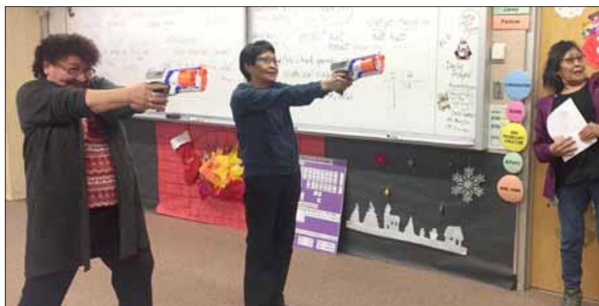
Playing a language game at the Gwich'in Literacy Session

The session began with discussions of traditional Gwich'in place names and their origins. YNLC has adapted a map of the traditional Gwich'in territory that can be used as a teaching tool. Participants then worked on the techniques for constructing a listening exercise and adapting it for different levels of fluency.