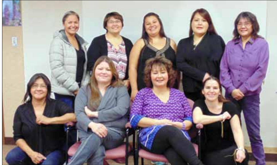
Diploma Training Session participants

Linguistic topics covered included stops and affricates; places of articulation; word order and person markers; positional phrases; and listening exercises incorporating all the languages in the room.