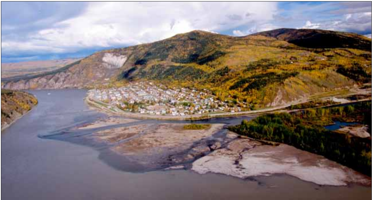
Dawson City showing the Tr'ondëk (Klondike River) entering the Yukon River. The area around the river mouth (Tr'ochek) was a very important salmon fishing place for the Hän people. The prominent slide in the background is known in the Hän language as Èdhà Dàdhèchan, (moose) skin hanging up.

YNLC staff also participated in various courses, conferences and meetings in Yukon and Alberta relating to language development, learning and teaching.