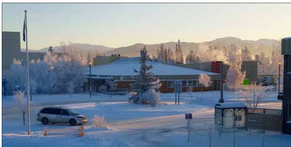
Grey Mountain from the YNLC library in November. In Southern Tutchone, Grey Mountain is known as The May.