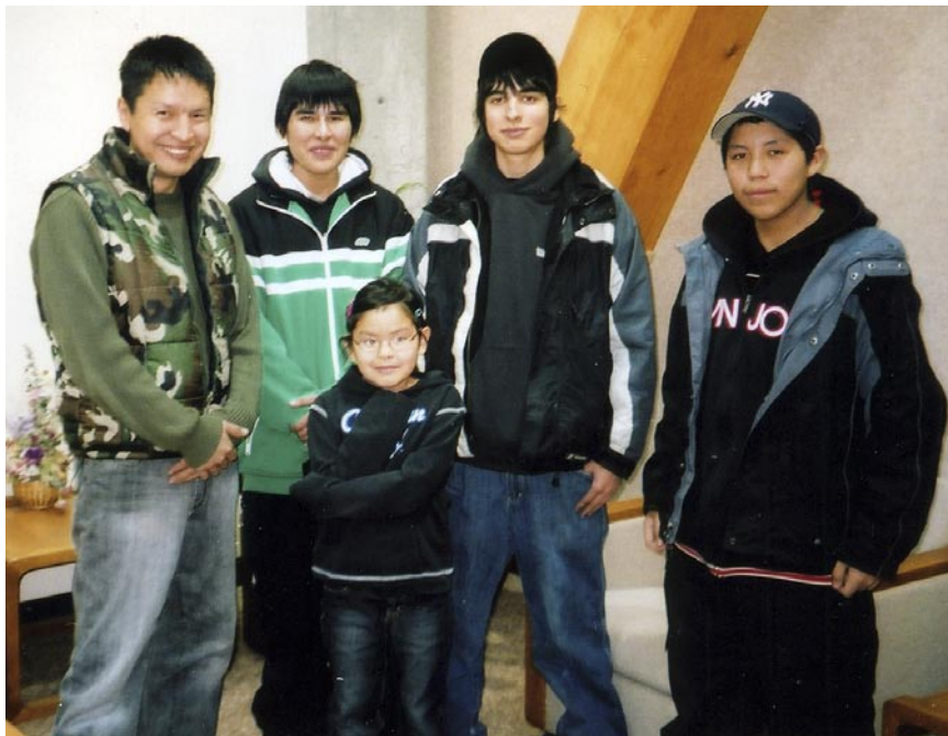
Participants at the Gwich'in Literacy session

YNLC’s activities for the second half of 2006 are summarized in the table accompanying this report.