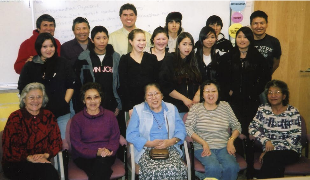
Participants at the Gwich'in Literacy Session