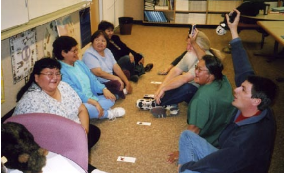
Participants in the Introduction to Native Language Teaching session