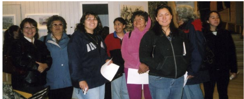
Certificate Training participants at McBride Museum

Attendance at the training sessions is part of the course requirements for the three-year Certificate program accredited by Yukon College. Participants must also complete three years of classroom experience in order to receive their certificate. Graduates of the Certificate program may go on to take a two-year Diploma program, during which they further develop their linguistic and teaching skills, create original teaching materials, and document oral history and traditional narratives.