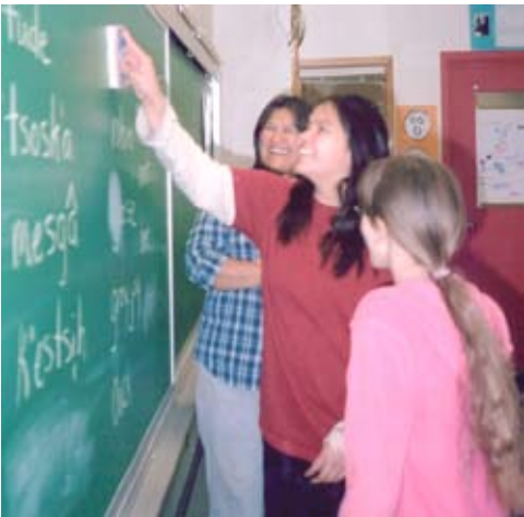
Kaska class in Ross River