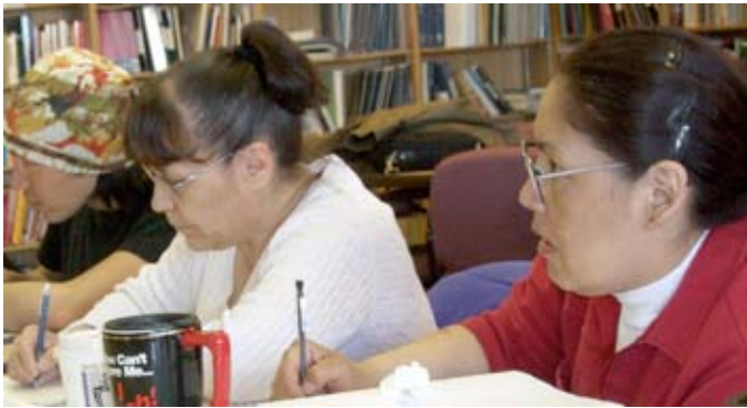
Southern Tutchone Participants

to the cultural and language revitalization efforts taking place within their home communities. YNLC's extended family of graduates also includes a significant group of language teachers and specialists residing in Alaska, British Columbia, and the Northwest Territories.