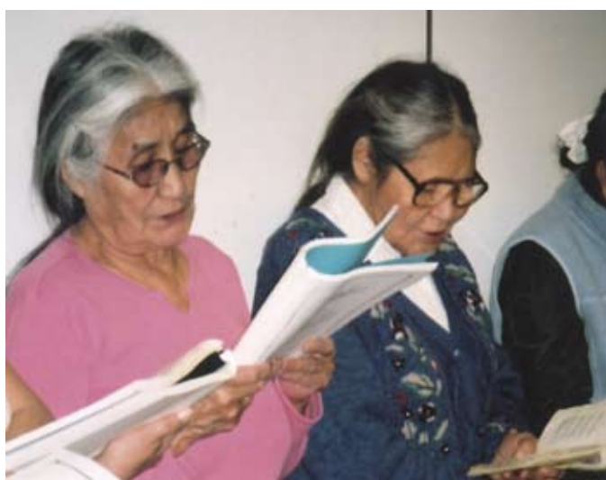
Gwich'in Elders sing Tukudh Chilig

As well as the reports from all the spring sessions, 15 previous literacy session reports were reprinted due to demand. The language material (from as far back as 1994) is still very useful for teaching and learning. Six language lesson books and YNLC staff member Anne Ranigler's Northern Tutchone Listening Exercise book were also reprinted.