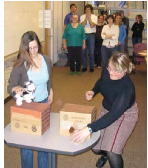
BSW students play a language game