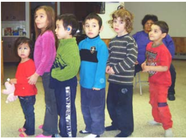
Haines Junction children playing a S. Tutchone language game