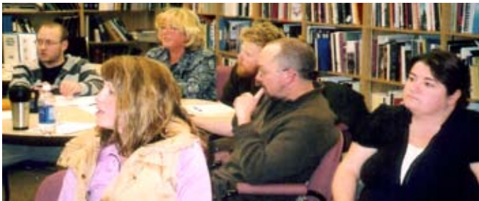
Yukon College students at YNLC