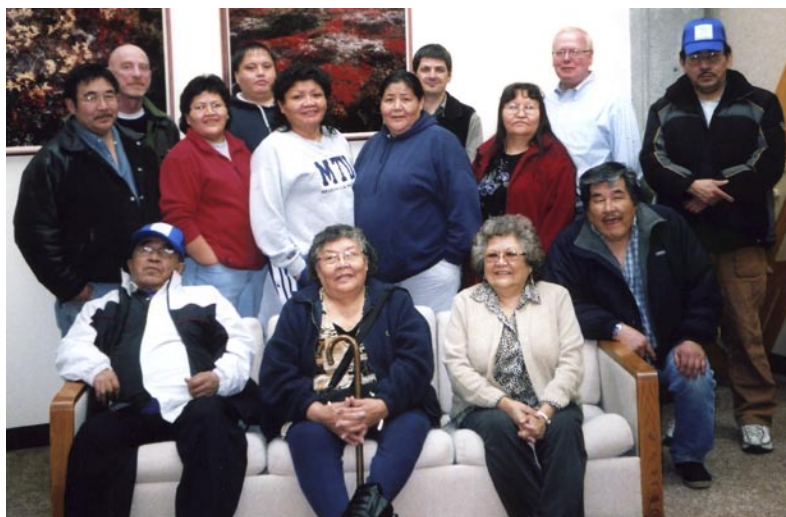
Participants in the February Upper Tanana Literacy Session