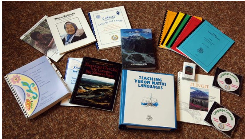
A selection of the YNLC materials available