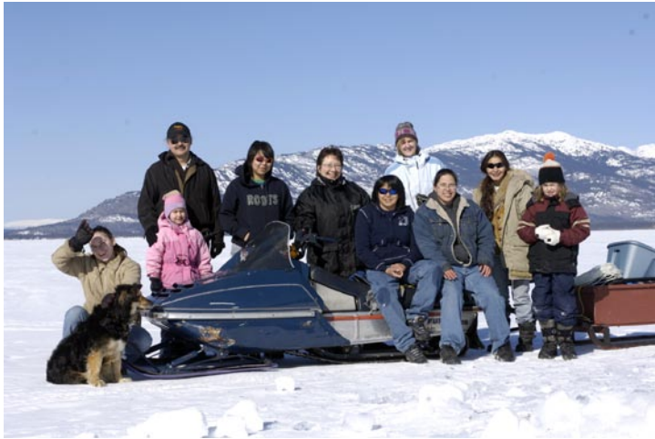
Members of the KDFN Southern Tutchone language class at Marsh Lake

The Ta’an Kwach’an Council has requested the help of YNLC in developing an interactive CD on Southern Tutchone place names in their area, including Lake Laberge and the region’s lakes. This CD would be modelled on Dákeyi , the existing Southern Tutchone place names CD created by YNLC.